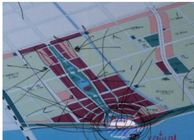
Fig.2 land use planning around site