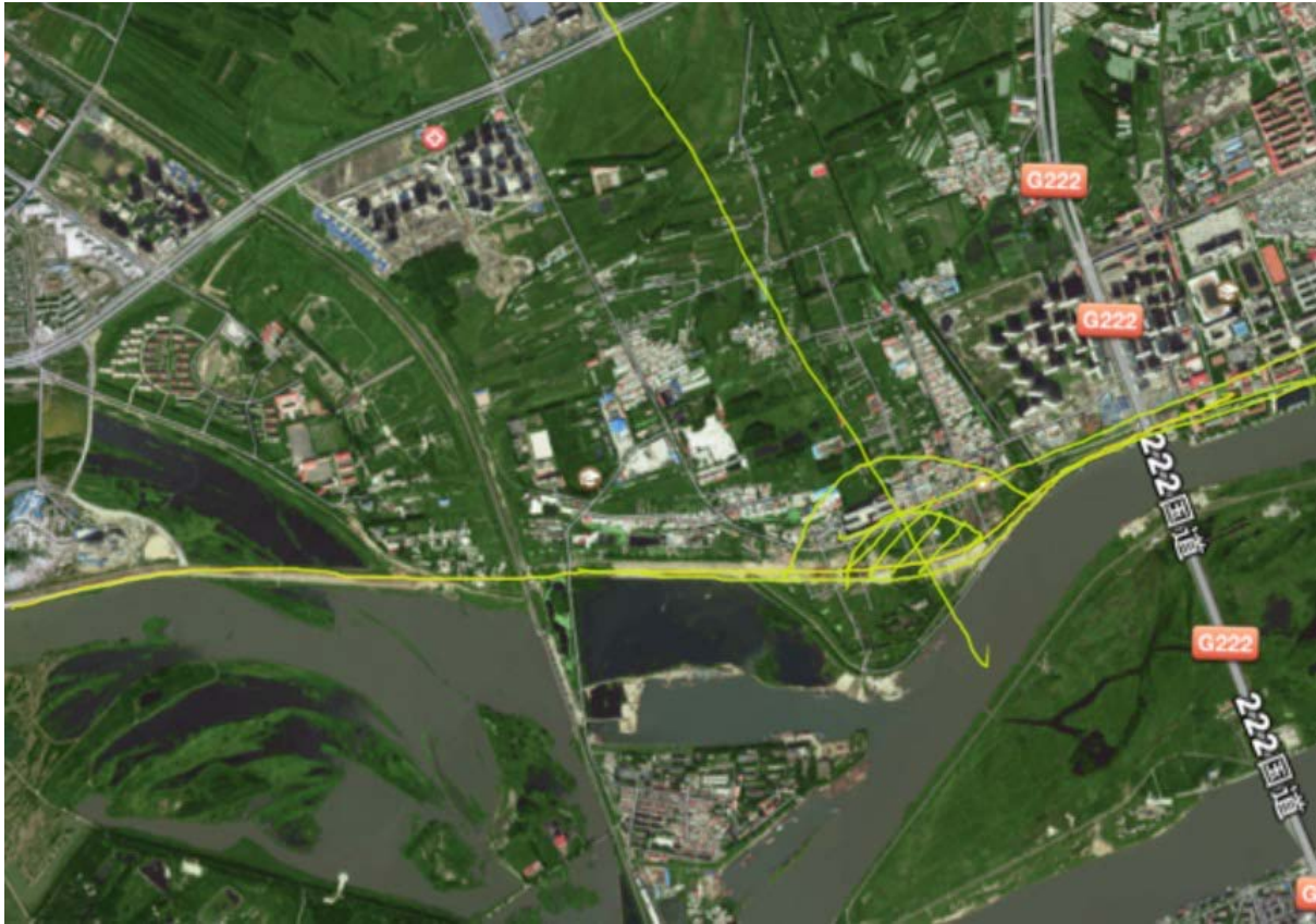
Fig.3 Google earth view of the area